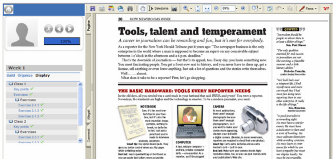
Fig. 4: Screenshot from LIN109 website

The use of coherently developed content sources allowed students to call on their own prior knowledge to learn additional language and content material. The curriculum and activity sequences were made available on a flexible and adaptable e-learning environment (fig. 4).